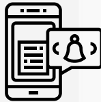
Alert Notification Systems