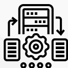
Real-Time Data Processing

The surveillance system uses advanced real-time analytics technology to process and analyze the data collected by the system's sensors and cameras.