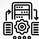
Real-Time Data Processing

The surveillance system uses advanced real-time analytics technology to process and analyze the data collected by the system's sensors and cameras.